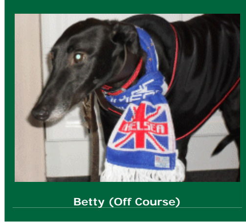
Betty (Off Course)