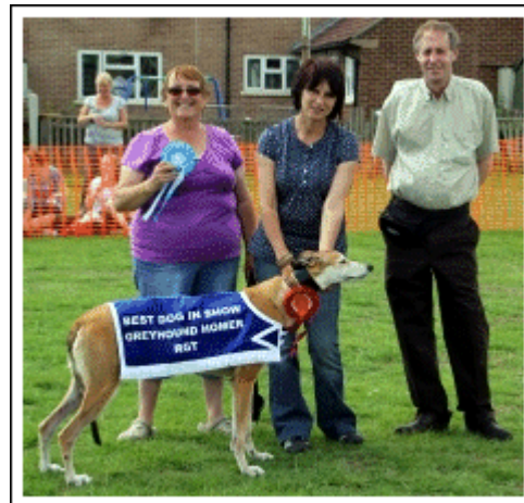
Above: Tigger, Best Dog in Show