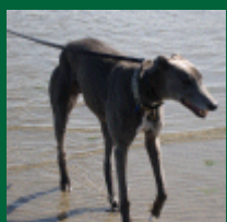
'life's hard at the beach'