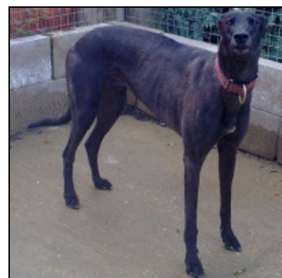
Tommy, call 01279 501 899

A February 2005 boy, Tommy is a very friendly lad who walks well on the lead and who would fit in well with most family circumstances. Although listed in our Special Dogs section Tommy has never been in a home, Tommy is featured here because he will need medication for the rest of his life due to an overactive immune system which causes him to suffer from Gingivitis. This means he is on Steroids to control the condition, the cost of which will be met by the Retired