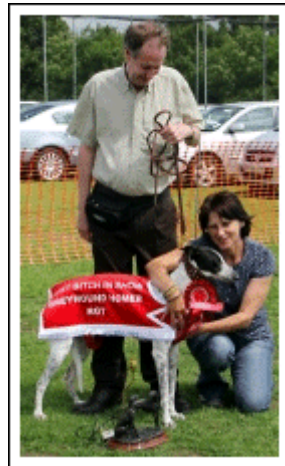
Above: Lady, Best Bitch in Show

So the next time you need to find something online, please use http://greyhoundhomer.easysearch.org.uk and raise money for Greyhoundhomer RGT with every search you make. Why not make it your homepage?